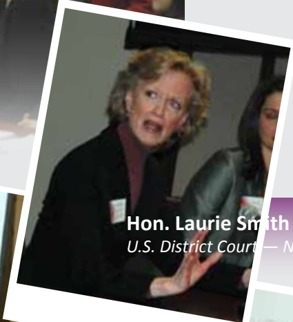
Hon. Laurie Smith Camp U.S. District Court — Nebraska